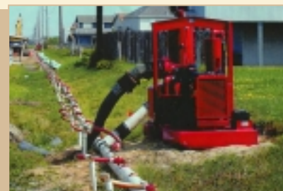
Wellpoint system, Galveston Texas.